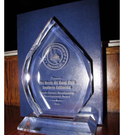
CAL 4 Wheel Drive, new member award